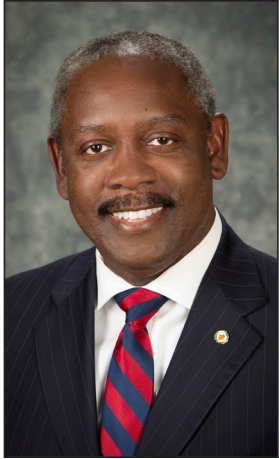
Jerry L. Demings Orange County Mayor